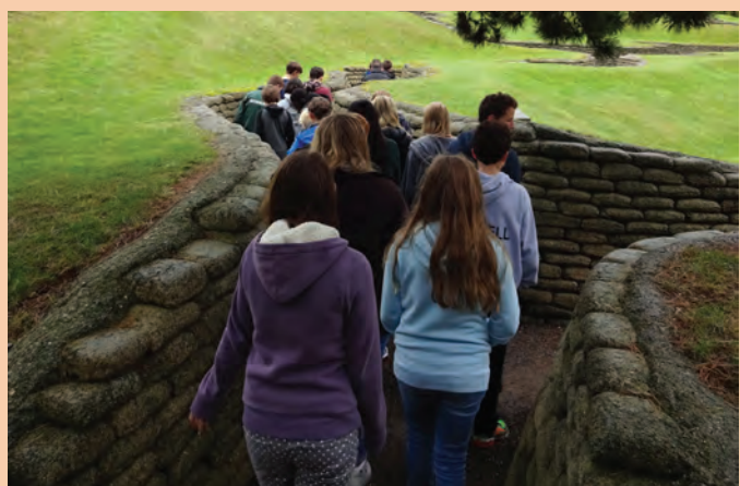
GCSE History students on their Battlefields trip to Northern France and Belgium